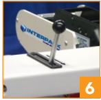
Single handle locks upper head to both columns