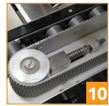
Self-tensioning & self-tracking drive belts simplify belt replacement