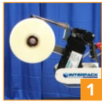
Tip-up top tape head eases roll replacement