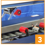
Offset tape heads process cases as low as 3.5"