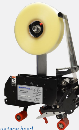
ET 2Plus tape head

When you compare features, benefits and value, Interpack Case Sealers are the right choice for operators, plant engineers, maintenance and purchasing.