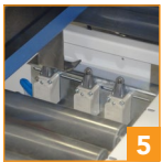
No case length adjustment necessary