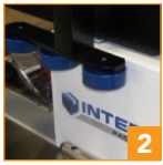
3-wheel top squeezer