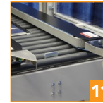
Side belt drive secures the case during processing