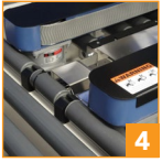
Twin 1/3 HP gear motors to process up to 85 lb cases