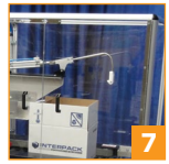
Standard interlocking safety shields (operator side)