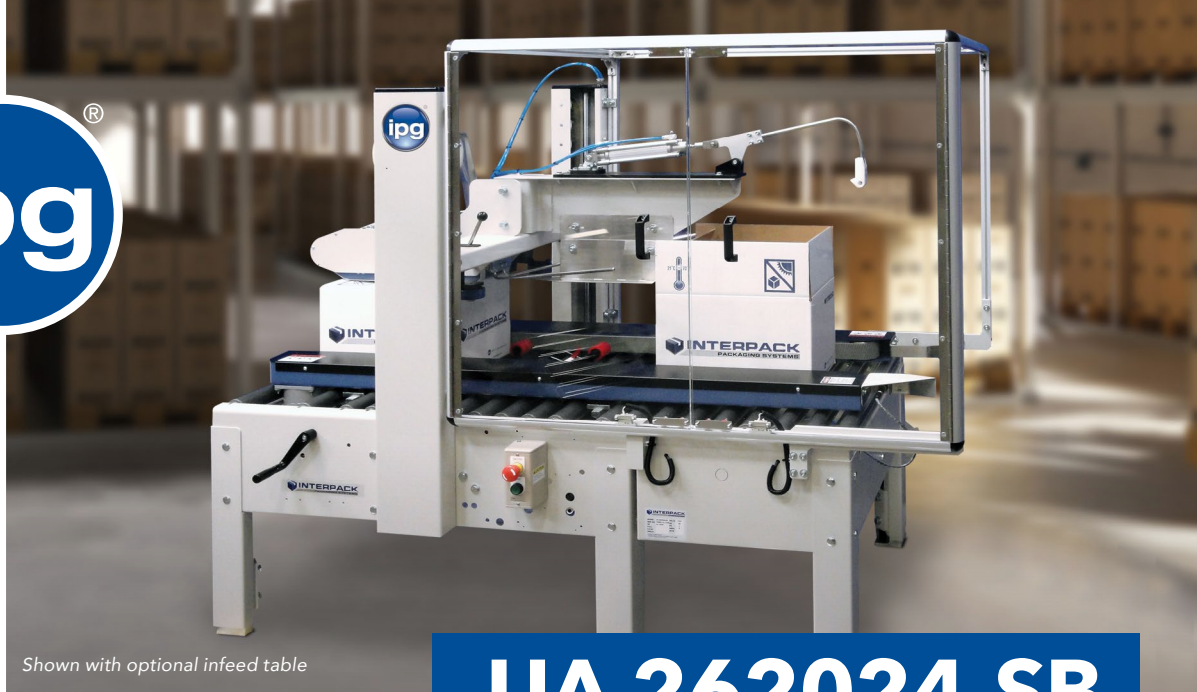
Shown with optional infeed table