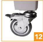
Optional swivel & locking casters