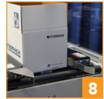
Standard indexing gate